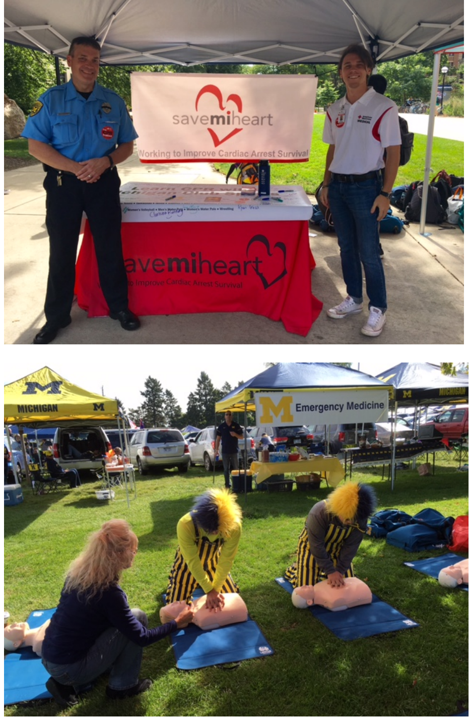
University of Michigan Department of Emergency Medicine tailgate HO-CPR event Sept. 24, 2016.